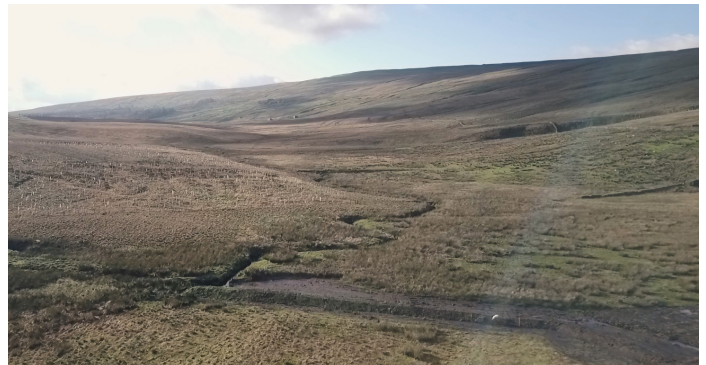
One of the Low Level Earth Bunds from the sky installed at Swarthghyll Farm on Oughtershaw Beck.

The bunds were constructed from material on site. The bottom half of the bund was constructed out of clay, to create an impermeable layer. The top half was mainly composed of topsoil, which has encouraged vegetation growth. The angle of slope was 1:3, this was to ensure no land slippage. Some floodplain lowering was conducted to allow natural drainage. JBA Consulting provided advice on concept design. An experienced local contractor was used, cutting down overall costs.